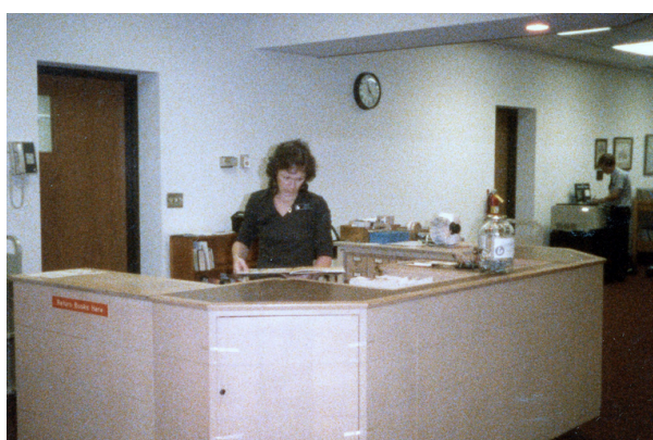
Digitized photos and newspaper article from the 1986 construction of the Christiansburg Library.

Meadowbrook | The Meadowbrook Public Library is deeply grateful for the continued support of the Friends of the Library. Thanks to your generosity, our winter programs were a wonderful success.