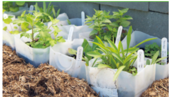
Thumbnail from a “Gardening in Winter” program at the Blacksburg Library happening Saturday, February 7th.

What is the best time of year? Some would vote for summer, and on a frigid January day like today, spring feels like a strong contender. There's even a song insisting the holidays hold the title. But for the library, the answer comes down to two possibilities: the joy and bustle of Summer Reading—or my own favorite day of all: the day the Friends write their annual donation check. It may not be as catchy a name as “Arbor Day,” but it is a tremendously important day for what it allows the Montgomery-Floyd Regional Library to accomplish throughout the year.