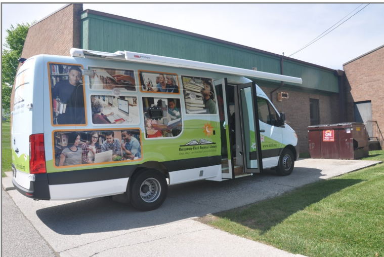
New MRFL Mobile Unit